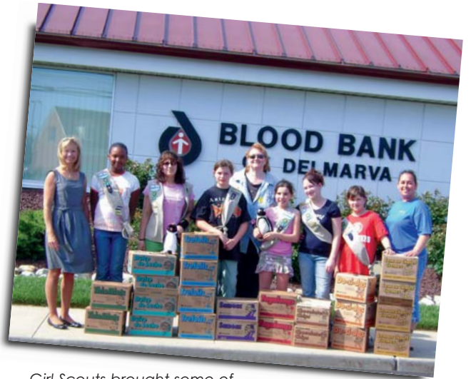
Girl Scouts brought some of their famous cookies to the Blood Bank's Donor Center in Salisbury for folks to enjoy after giving blood. Thank you!